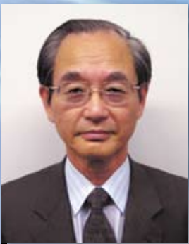
President, Japan Water Research Center Chairman, the 9 th International Symposium on Water Supply Technology Steering Committee

We sincerely look forward to everyone's participation in the 9 th International Symposium on Water Supply Technology.